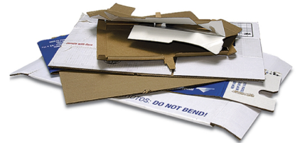
CARDBOARD, OFFICE PAPER, NEWSPAPER